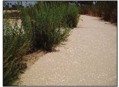
CHARACTER OF PROPOSED TRAIL (For illustration only)