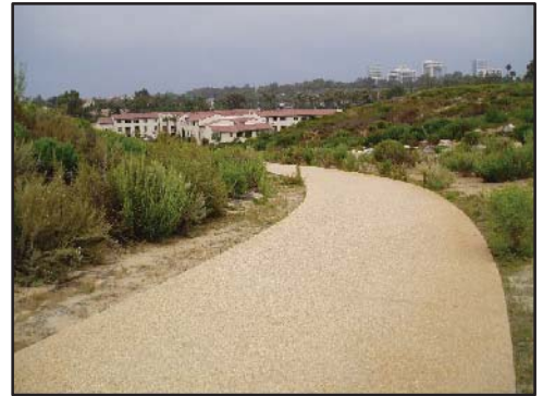
CHARACTER OF PROPOSED TRAIL (For illustration only)