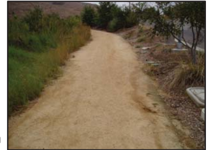
CHARACTER OF PROPOSED TRAIL (For illustration only)