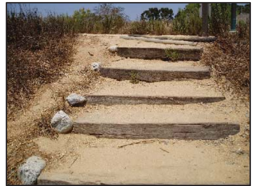
CHARACTER OF PROPOSED TRAIL (For illustration only)