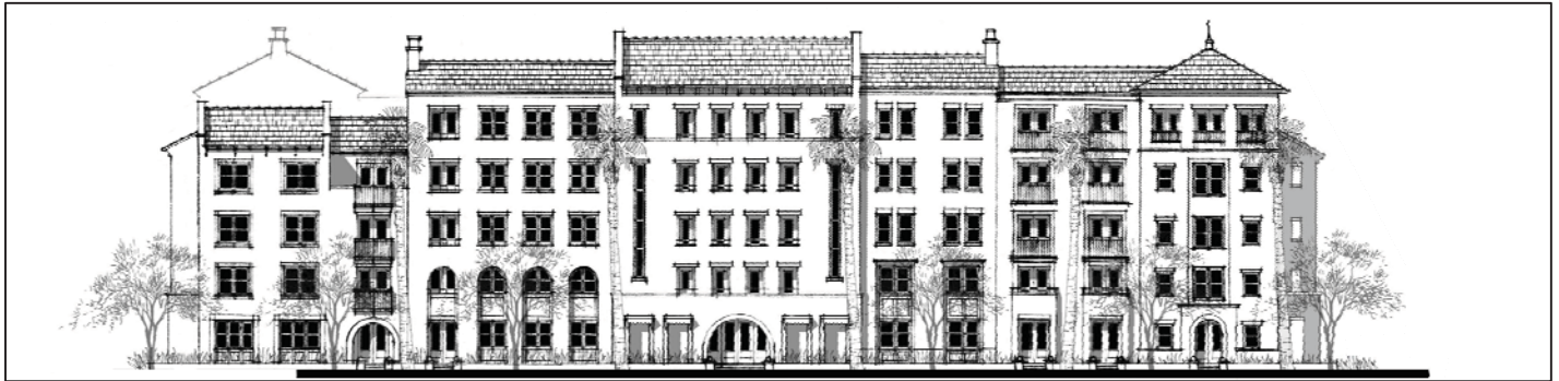
Typical Front Elevations