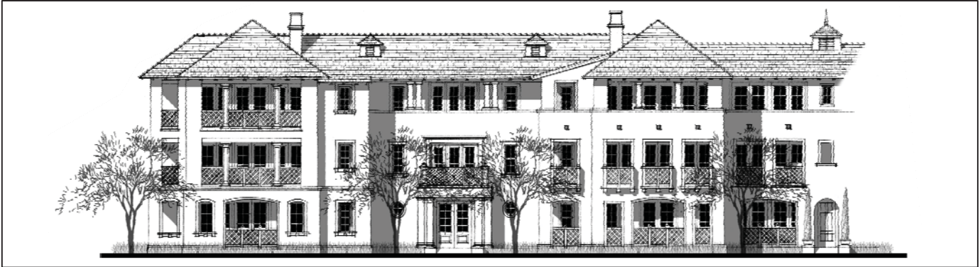
Typical Front Elevations