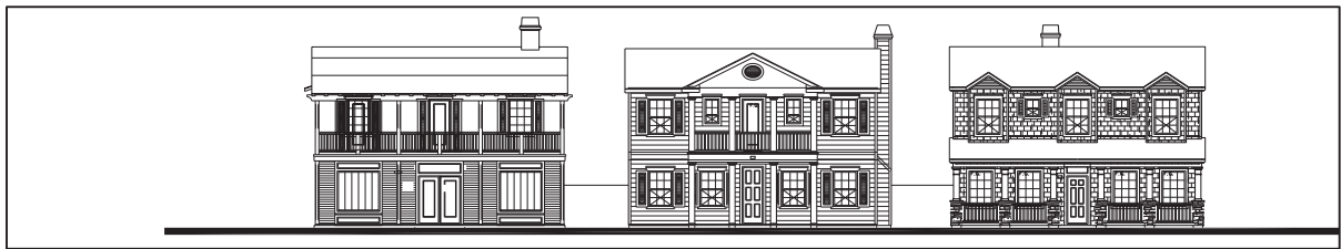
Typical Elevations Adjacent Bluff Park