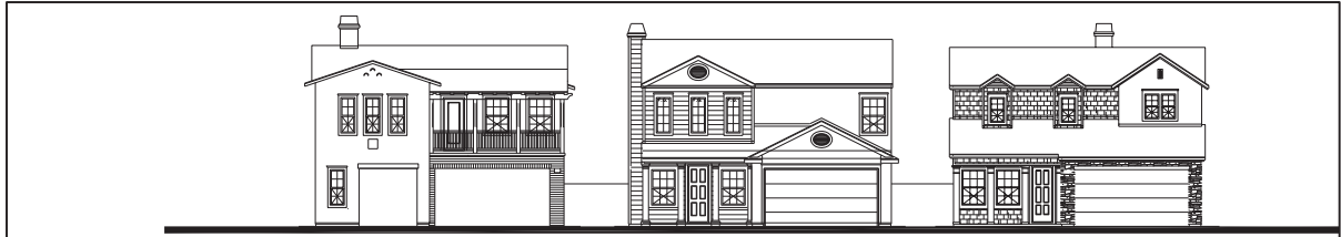
Typical Elevations Adjacent Local Street