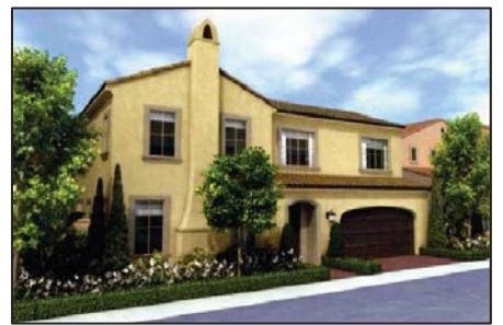
Typical Front Elevations