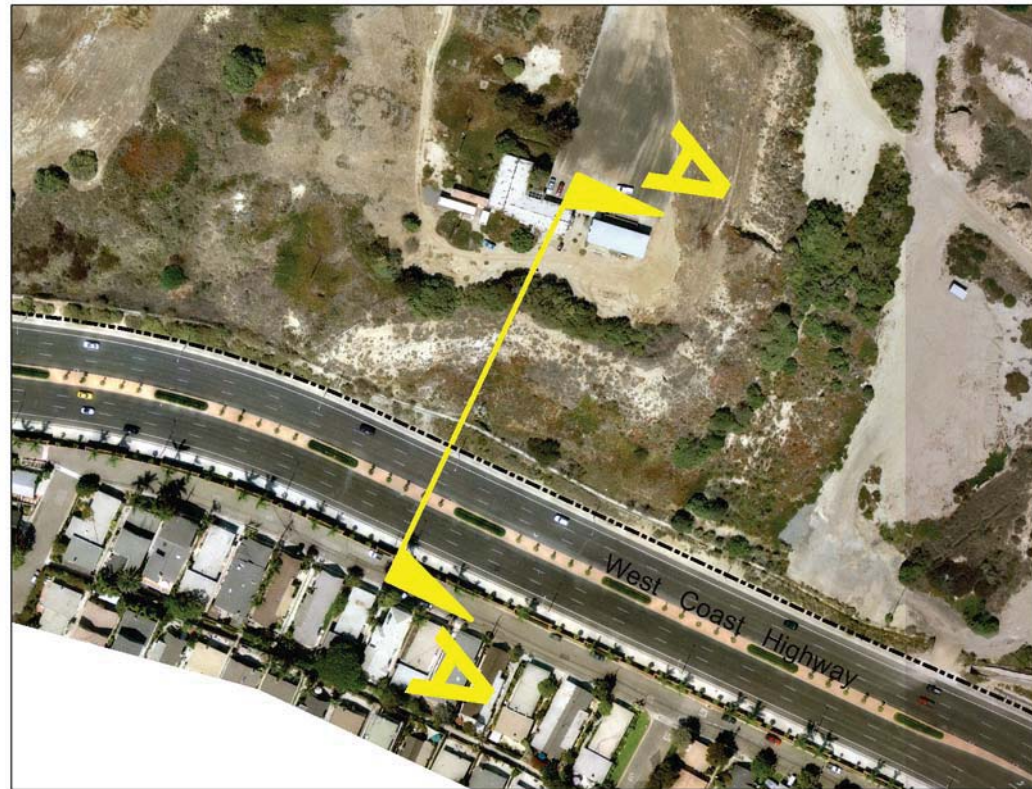
Aerial Photograph of Existing Conditions