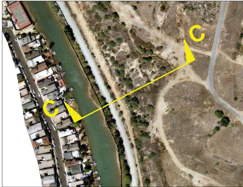
Aerial Photograph of Existing Conditions