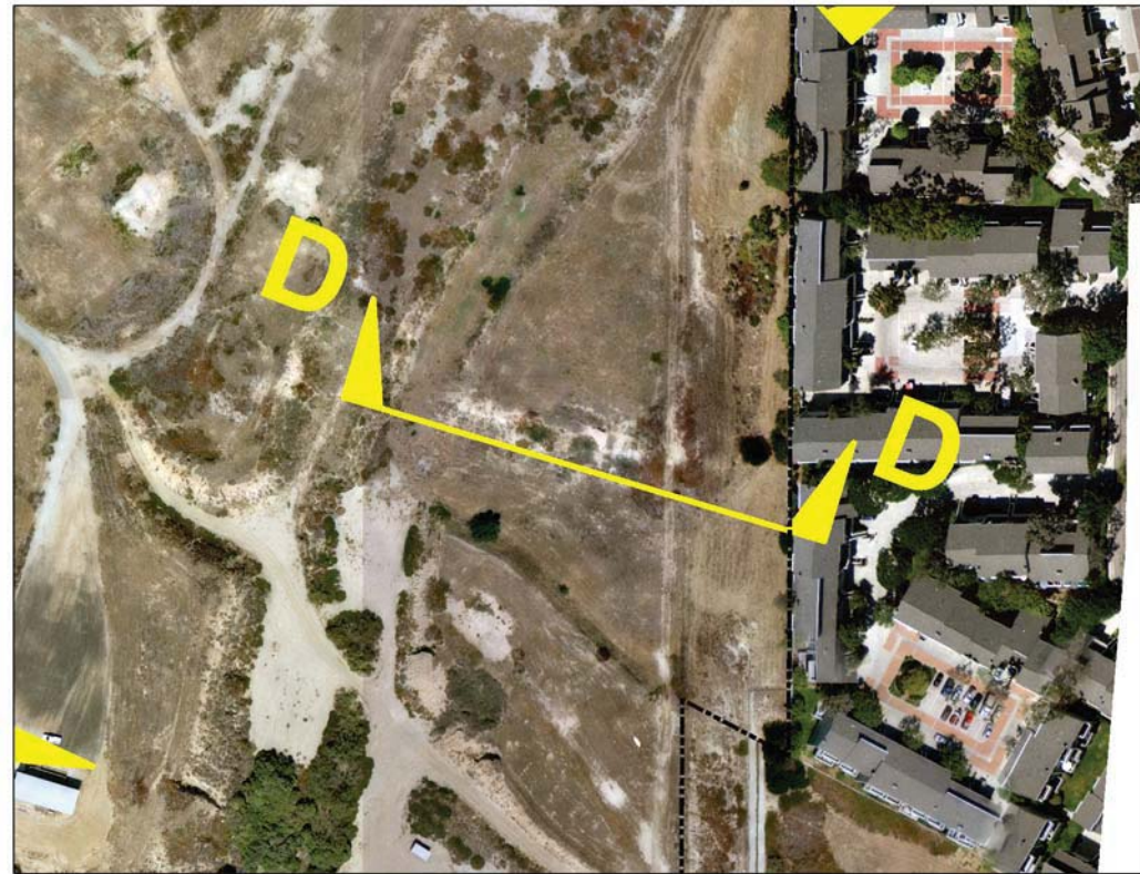
Aerial Photograph of Existing Conditions