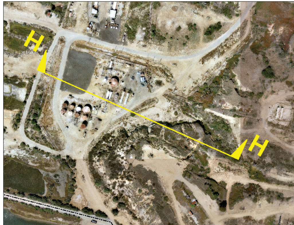
Aerial Photograph of Existing Conditions