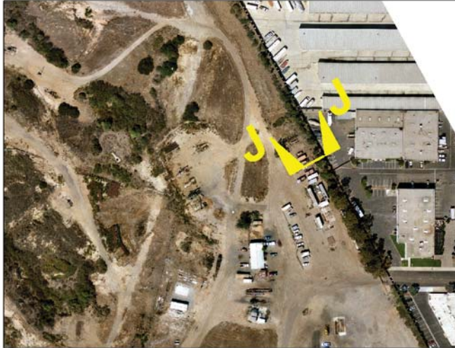
Aerial Photograph of Existing Conditions