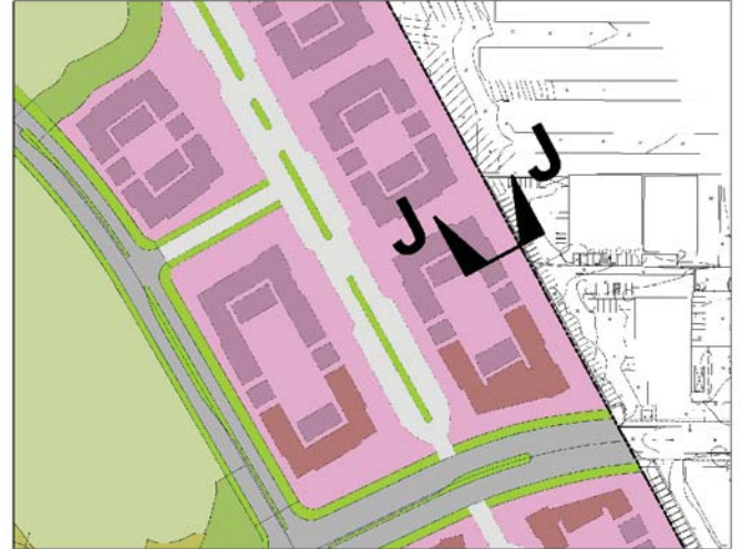
Master Development Plan of Proposed Project