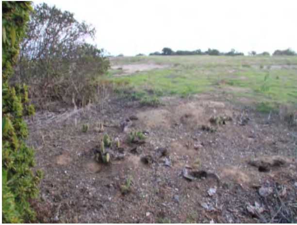
The photos above show the same patch of Coastal Prickly-Pear before and after unpermitted clearing. Note that only the native cactus was removed, leaving the exotic Myoporum, even though the cactus appeared to be healthy whereas the background Myoporum appeared to have been in poor condition. This indicates intent to remove potential ESHA versus random removal of unhealthy vegetation.