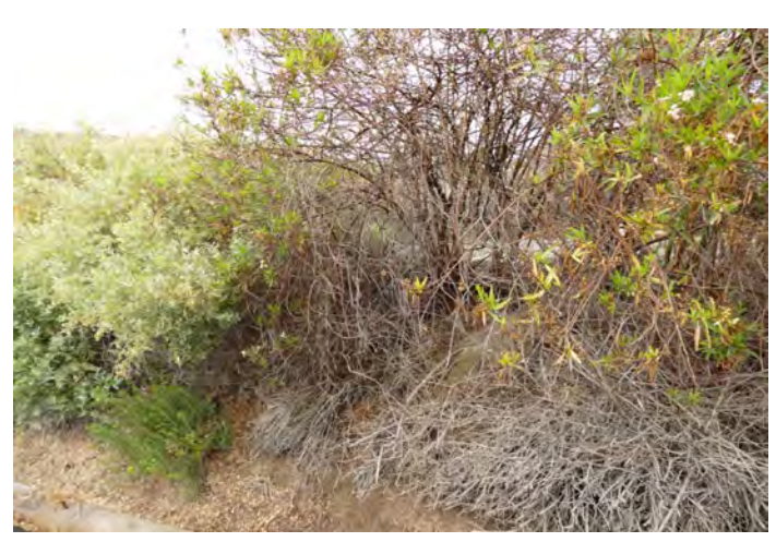
Photograph, facing northeast, showing "Quailbush Scrub" (a form of Southern Coastal Bluff Scrub) growing near the proposed southern terminus of Bluff Road, April 7, 2016. Robert A. Hamilton.