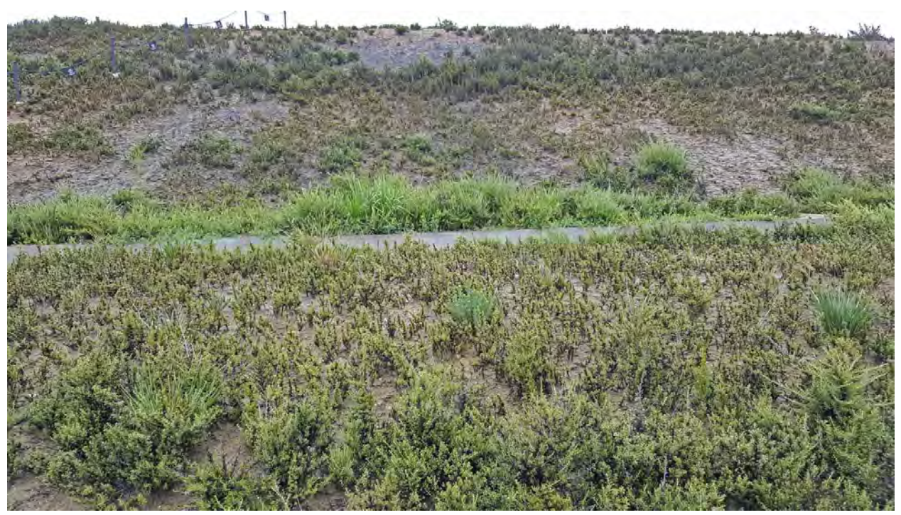
Photo, taken on April 7, 2016, showing stunted growth and poor cover of California Sagebrush ( Artemisia californica ) installed on the slopes of Sunset Ridge Park, adjacent to Banning Ranch. California Sagebrush is widespread and generally valuable for gnatcatchers, but does not naturally occur in this area. Perhaps due to elevated soil salinity, most of the sagebrush planted at Sunset Ridge Park has grown to a height of only 8-12 inches and provides sparse cover unsuitable for use by California Gnatcatchers. Nevertheless, Dudek plans to "improve" the Southern Coastal Bluff Scrub at Banning Ranch by introducing California Sagebrush.

The applicant's plan to introduce generic sagebrush-buckwheat scrub that does not occur on Banning Ranch naturally is ecologically inappropriate and entirely unnecessary. Note, for example, that the City of Newport Beach has planted the adjacent Sunset Ridge Park site extensively with California sagebrush, with the poor results shown in the photo below: