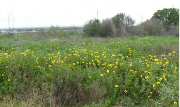
The photos above show an area of Banning Ranch subjected to unpermitted mowing on September 19, 2012 (left) and with scrub regenerating naturally on January 29, 2015 (right).