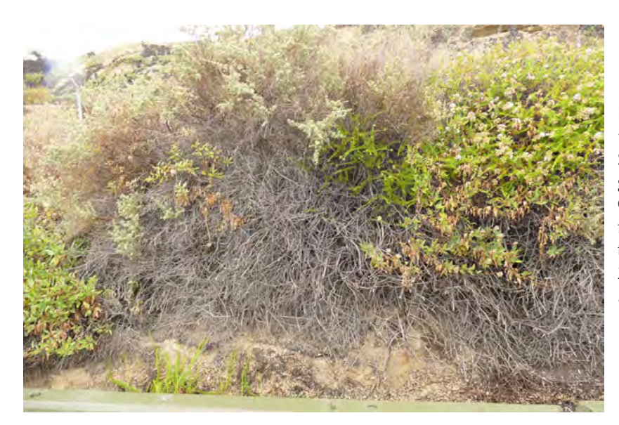
Photograph, facing north, showing "Quailbush Scrub" (a form of Southern Coastal Bluff Scrub) growing on the site along Pacific Coast Highway, several hundred feet west of the proposed southern terminus of Bluff Road, April 7, 2016.

Several hundred feet to the west, also on the site, comparable scrub growing along on the shoulder of Pacific Coast Highway, is mapped as "Quailbush Scrub" (a form of Southern Coastal Bluff Scrub) and treated as ESHA in the staff report: