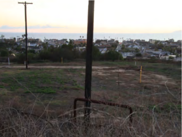
The photos above show the same patch of California Brittlebush Scrub before and after unpermitted clearing. California Brittlebush ( Encelia californica ), a plant that the Orange County Fire Authority expressly allows to remain in all fuel modification zones.<sup>2</sup>

These photos demonstrate the extensive and purposeful nature of the Coastal Act violations undertaken by the applicant ahead of their plans to convert Banning Ranch into a massive residential/commercial development.