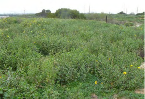
The photos above show an area of Banning Ranch subjected to unpermitted mowing on May 30, 2012 (left) and with scrub regenerating naturally on January 29, 2015 (right).

The preceding photos show that, despite a record five-year drought that has not yet broken in our region, substantial areas of California Brittlebush Scrub have begun to vigorously recolonize areas that were cleared. This natural recolonization of illegally cleared habitat stands in contrast to suggestions made by some commissioners, at last October's hearing, that disturbed areas would inevitably be overtaken by ice plant and other exotic weeds found in some parts of Banning Ranch. Similarly, NBR and their consultants continually repeat the demonstrably false assertion that only their restoration plans, which would be implemented in concert with their massive development, would be able to halt the slide of Banning Ranch toward becoming one giant weed patch. Beyond these considerations, it is completely unacceptable that some commissioners seem to accept the applicant's argument that the Commission has a duty to approve a sprawling development project in exchange for the applicant restoring areas that the applicant and/or their lessee disturbed illegally.